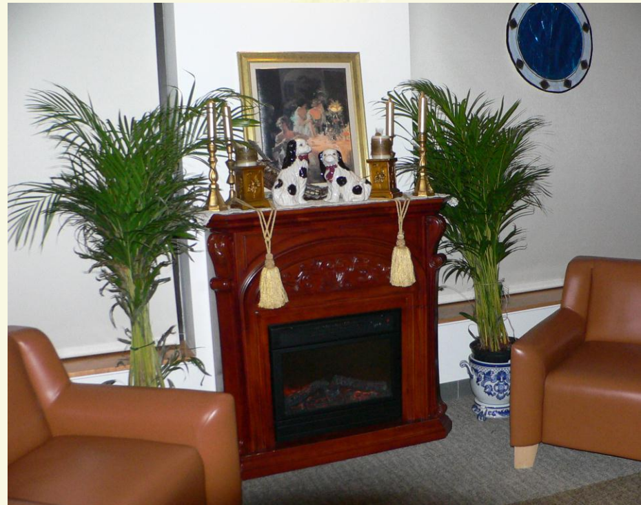
Potted palms and accessories transformed the modern clubhouse into an intimate seating area on the Promenade Deck.