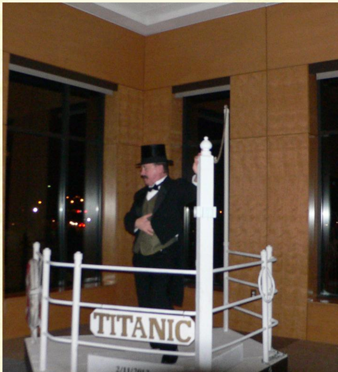
A replica of the bow of the Titanic provided passengers, like this gentleman dressed stylishly in top hat and tails, an opportunity to pose and be photographed.