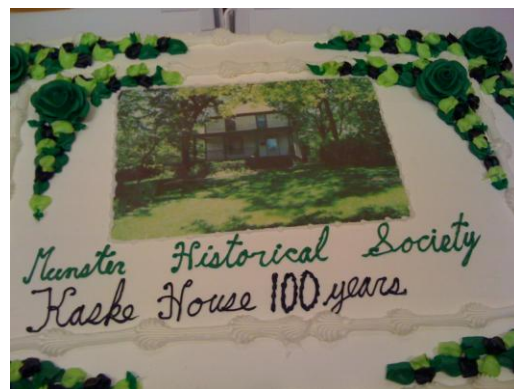
Annual Dinner Blue Ribbon Dessert Buffet featured Kaske House 100 th birthday cake and a delicious assortment of desserts homemade by MHS members.

Celebrate a Century! Newsletter published seasonally